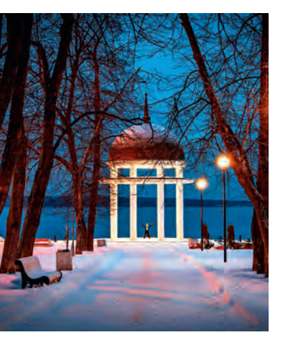
Rotunda on Lake Onego embankment

After the war, the large demand for canons subsided and the factory gradually went into decline. Many experienced workers were transferred to other facilities. Petrovsky (Peter's) Factory was finally shut down and its