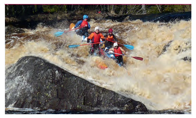
Whitewater rafting down the Uksunyoki river

Accommodations are available in cabins and in a hostel.