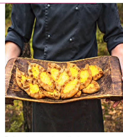
Traditional pastries – famous Karelian kalitki

The word "kalitki" is probably derived from the Finnish word kalittoa , meaning "spread," which is a kind of traditional Finnish pastry. The spread is applied to the surface of the dough. Also popular is the legend that the