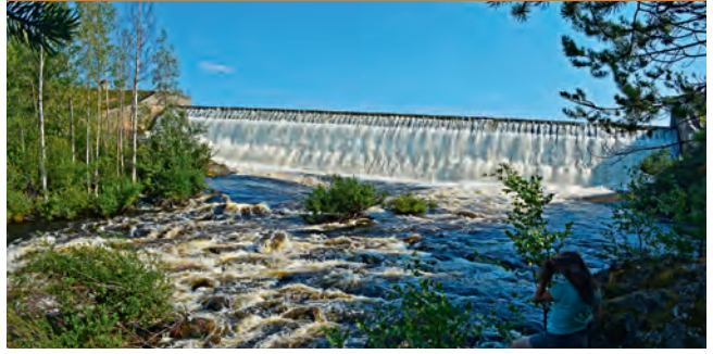
Shavanskaya spillway dam

At the end of the 17th century, Old Believers fleeing from persecution started settling on the remote shores of Lake Vygozero. The 18th century saw the construction here of the "Czar's Road," which linked the White Sea and Lake Onego. In the second half of the 18th century the Voitsky mine, close to present-day Nadvoitsy Township, extracted copper and gold. You can learn more about the history of this area by visiting the Museum Center (Mo–Fr from 10 am to 5 pm; 16B Segezha Str.; http://museumsegezha.ru).