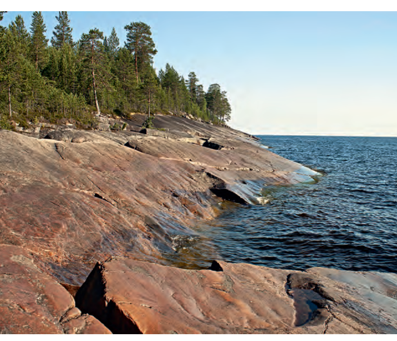
The Onego Lakeshore

Vacationers flock here all year round to relax from the hustle and bustle of city life, have a breath of healing forest air, spend time with a fishing rod on the lakeshore in the serenity of a warm summer, while in winter they can venture on a skiing trip to a quiet dormant forest or ride a snowmobile across the frozen rivers and lakes.