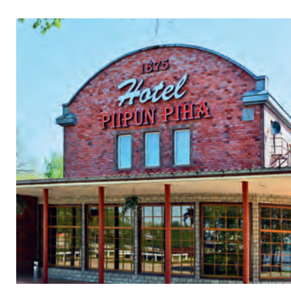
Sortavala. Hotel "Piipun Piha"

Considering the total number of tourists (some 1,3 million per year including independent travelers), there should be no problem finding accommodations in Karelia at any time of year. However, the factor of seasonality comes into play. When planning your summer travel or a trip during a