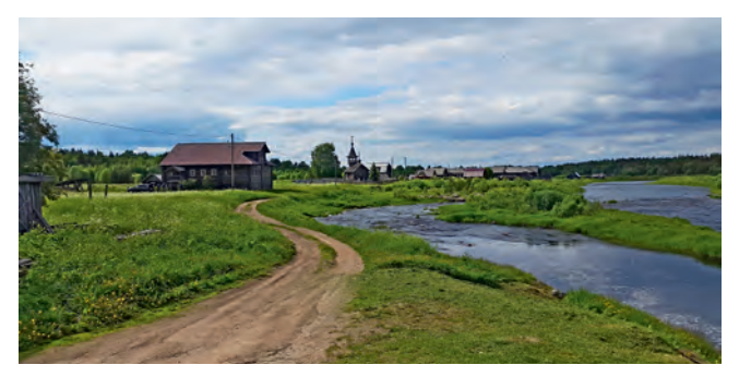
The unique village of Pialma

The travel distance from Pudozh to the welcome center in the village of Kuganovolok is 70 km.