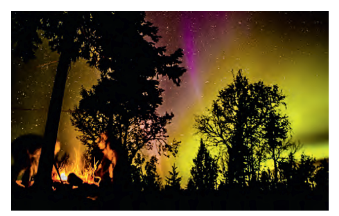
Campfire at night

Fans of trekking and hiking will appreciate the beauty of the local forests. Many hotels offer expeditions designed for several days led by experienced guides. The Ladoga lakeshore and Karelian heartland are also popular destinations for mountain bikers .