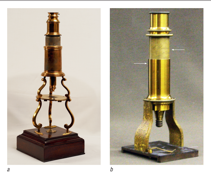
Fig. 2.1. Culpeper-Style microscope from the museum of the Department of Surgery of the S.M. Kirov Military Medical Academy (a); a simple microscope designed by the German optician E. Gartnak exhibiting in the museum at the Department of Histology with a course of embryology at S.M. Kirov Military Medical Academy (the 1830s–1840s). The inscription on the tube says: E. Hartnach Paris & Potsdam (upper arrow); the focusing is reached through direct movement of the tube (lower arrow) (b)

Imperor Peter the Great was the first to bring the microscope to Russia from Holland. Later, the St. Petersburg Academy of Sciences opened a mechanical workshop for producing microscopes and, in 1725, employed I.P. Kulibin and I.I. Belyaev. Russian scientist and naturalist M.V. Lomonosov (1711–1765), regarded as a founder of national science, made a great contribution to the development of microscopy in Russia by proposing a number of technical improvements to the construction and optical system of the microscope.