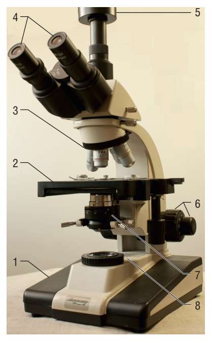
Fig. 2.5. Light microscope for biological research: 1 — base; 2 — stage; 3 revolving nosepiece with several objective lenses; 4 — eyepiece lenses of the binocular; 5 — microscope camera; 6 fine and coarse focus; 7 — condenser with an iris diaphragm; 8 — illuminator