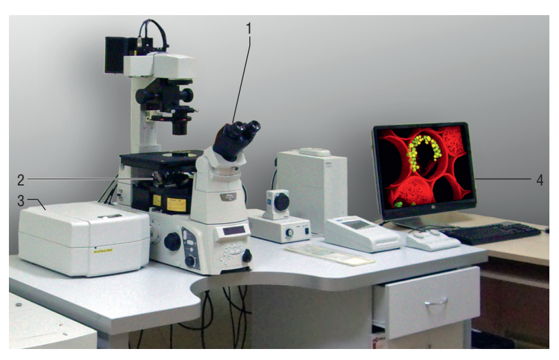
Fig. 2.6. Confocal microscope: 1 — light microscope; 2 — objectives; 3 — control unit of the scanning device that moves the light beam along the X , Y , Z axes; 4 — digital image processed by a computer program