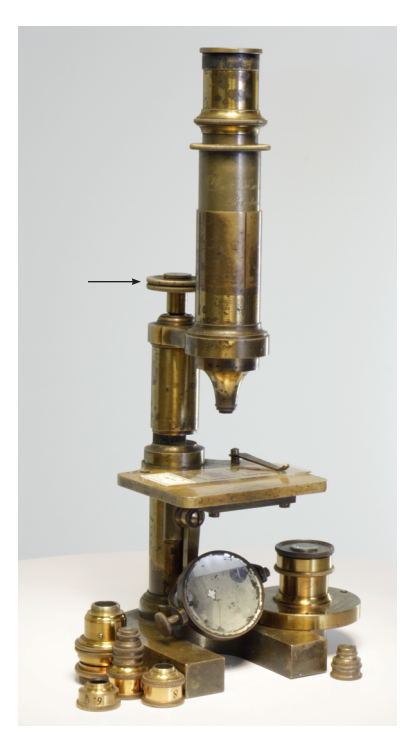
Fig. 2.2. Enhanced microscope made by Hartnack (1860–1870s); arrow fine focusing screw; coarse focusing is achieved through the direct movement of the tube