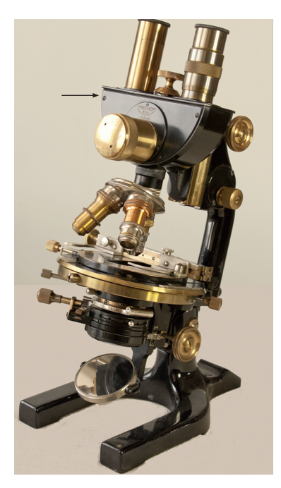
Fig. 2.4. Reichert microscope (Austria) with binocular head (arrow)